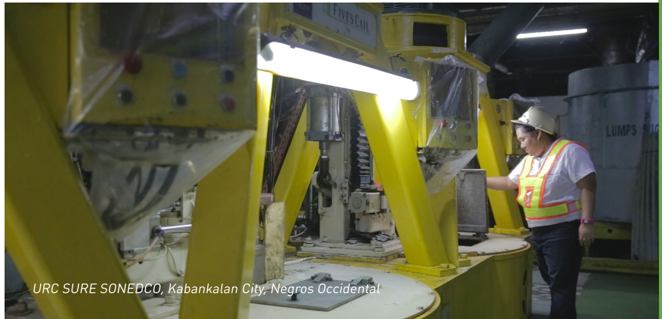
URC SURE SONEDCO, Kabankalan City, Negros Occidental

We have identified waste management as a strategic priority, and we intend to further improve on our existing programs.